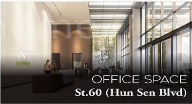
OFFICE SPACE St.60 (Hun Sen Blvd)